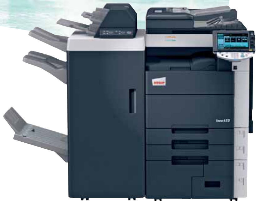
ineo 652 with staple finisher (FS-526), saddle kit (SD-508) and post inserter (PI-505)