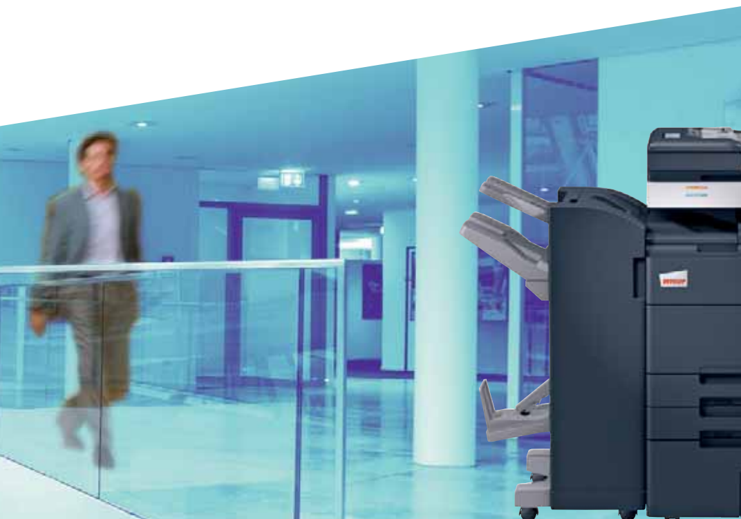
ineo 652 with staple finisher (FS-527), saddle kit (SD-508) and job separator (JS-603)