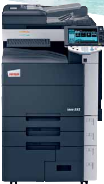
ineo 552 with output tray (OT-503), keyboard holder (KH-101) and external keyboard