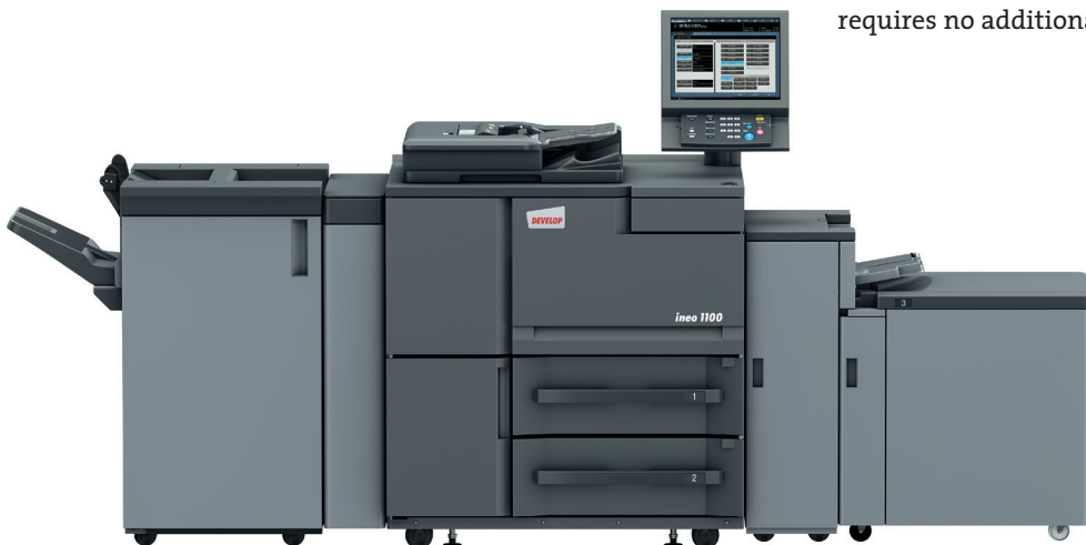
ineo 1100 with 100-sheet finisher FS-532, z-fold unit ZU-6o8, multi-bypass tray MB-5o7 and large capacity tray LU-412

Two ineo 1100 machines can be coupled in a network to tandem-print at 200 ppm – just the speed you need to deal with high-volume jobs, e.g. when presentation material has to be printed on demand. This is a standard feature of the ineo 1100 and requires no additional (and expensive) software.