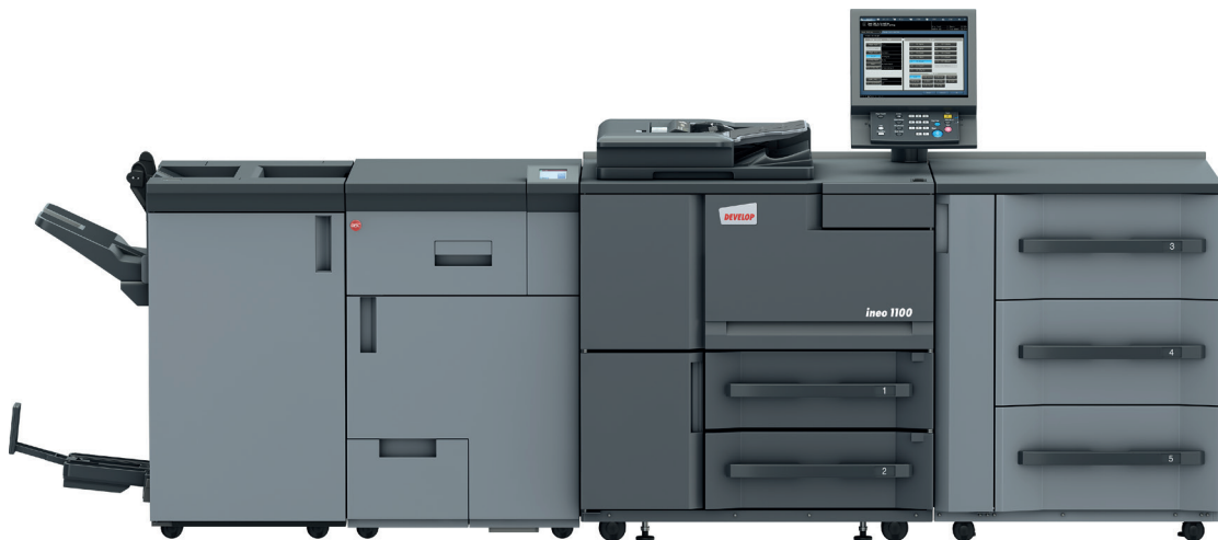
ineo 1100 with auto ring binder GP-502, 100 sheet-finisher FS-532, saddle stitch unit SD-510 and paper feed unit PF-709