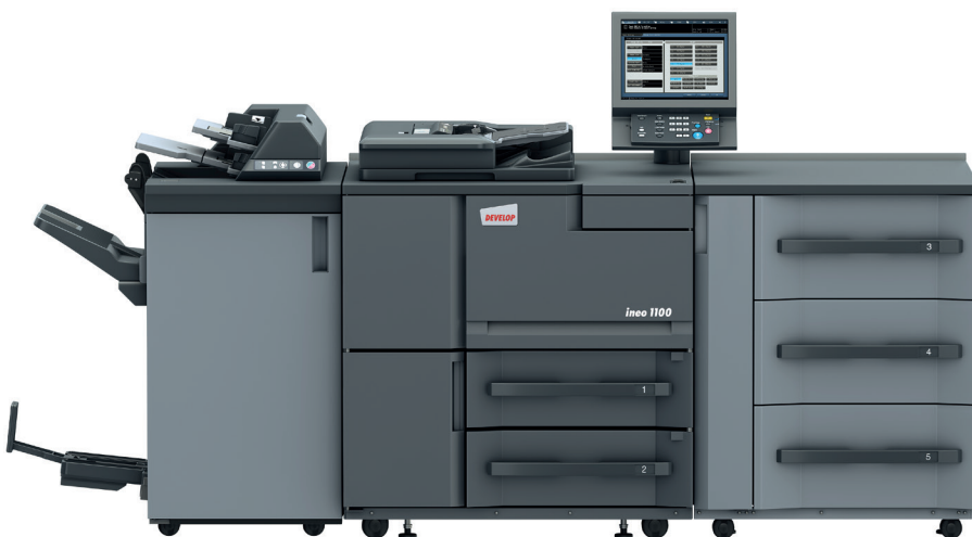
ineo 1100 with 100-sheet finisher FS-532, post inserter PI-502 and the paper feed unit PF-709

If you think you've seen everything in digital printing, take a good look at the quality of this machine's printing. We believe it is unique. Such eye-catching quality is based on a series of innovative technologies, such as precision LED exposure with an impressive resolution of up to 1,200 dpi, sophisticated and ultra-stable media handling, and DEVELOP's unique screening technology. These technical innovations work hand in hand with DEVELOP's own ineo toner to deliver consistently excellent digital quality. And the advantage of digital technology is that you can produce even small print runs at a profit. This is especially true of the ineo 1100 since it runs economically, scans at high speed, and is easy to operate via a clearly arranged touchscreen. All factors you can build on for business success.